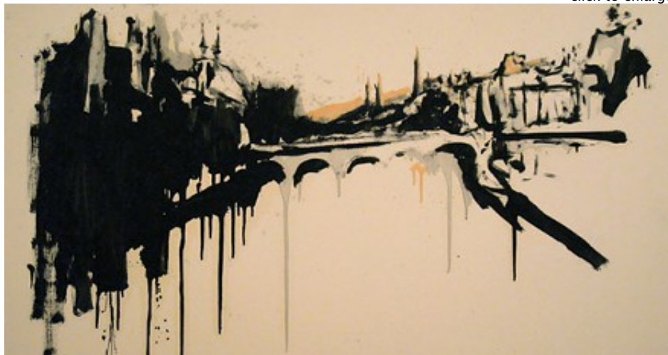
Johnson's View From Pont Neuf