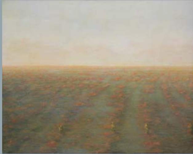
Place of Dead Roads, oil on canvas, 48" x 60"