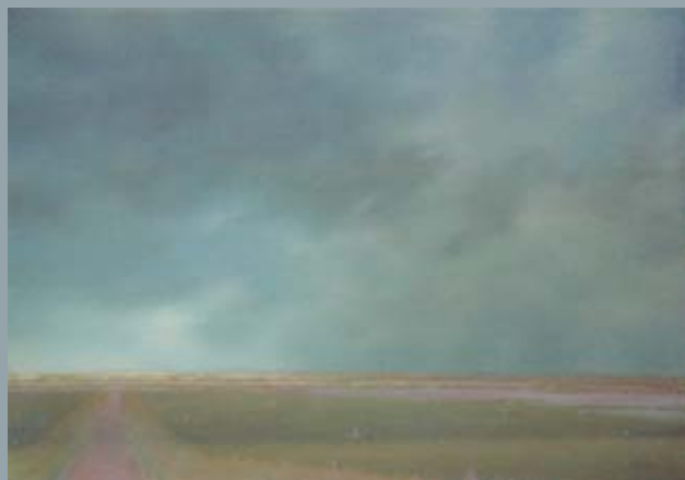
Near Marfa, oil on canvas, 42" x 60"