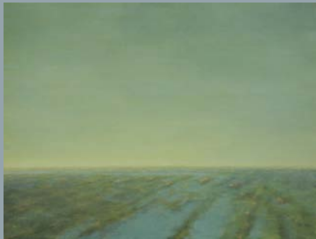
Road III, oil on canvas, 36" x 48"