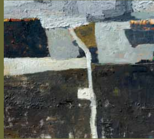
FOLDING FLAP: Red (detail) oil on canvas 48" x 48"