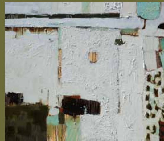
BELOW: Retour oil on canvas 30" x 36"