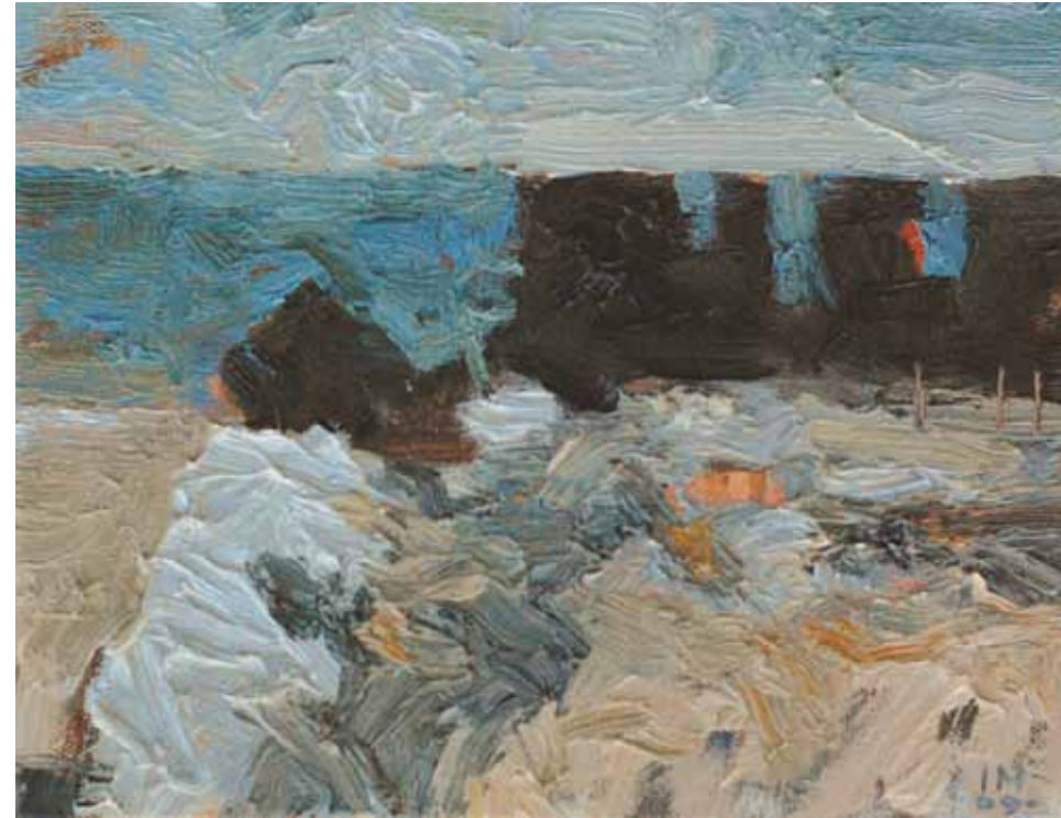
Beach Study, oil on canvas, 7" x 9"